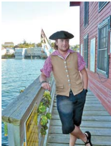
Photo above - You can find all kinds of salty characters in Coupeville including the crew of the Hawaiian Chieftain.

The Oak Harbor Marina is on the south side of the area still called the Seaplane Base, though the Navy has not flown seaplanes from there in 40 years. The area north of the Oak Harbor Marina, on the Crescent Harborside was guarded and closed