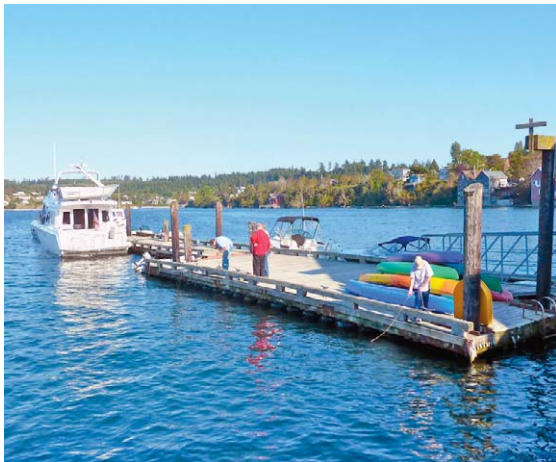
The dock at Coupeville with a view of the historic seacoast town behind. Kayak rentals are available from the gift shop on the wharf.

Once ashore, it is a pleasant walk of just over a half-mile to the stores and restaurants that stretch for another mile along the waterfront. The grocery stores are almost a mile and half away, just past the Highway 20 intersection. There is a free bus service that operates when you call and will pick up 20 and 50 minutes after the hour. If you need to shop for major items there are shops and stores for just about anything (including a Walmart) in Oak Harbor,