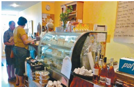
Photo above - Bayleaf, in Oak Harbor, can prepare a "European Lunch" to enjoy in town or underway with imported cheeses, meats and a special wine. There is also a Bayleaf store just up the street from the Wharf in Coupeville.

One block up from the waterfront is "Christopher's" for casual dining with another "Bayleaf" store for wine and cheese and other specialties. "A Touch of Dutch" will set you up with Dutch delicacies that may be a new treat for your palette.