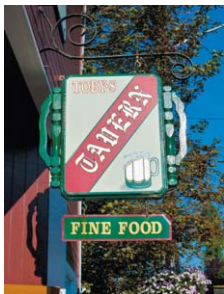
Photo above - Toby's, in Coupeville is just one of the many local favorite restaurants. Try their fresh local steamed mussels.

south or north, with a lot of restaurants, shops and places to explore.